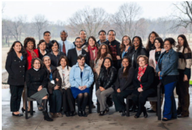
Celebrate our 2013 CoLA Graduates!